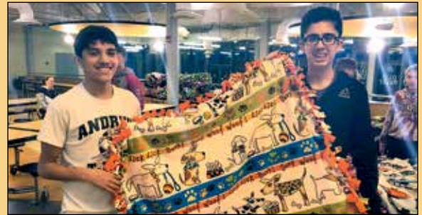
One of 60 blankets made for Student Council's Project Linus event. Great job boys!