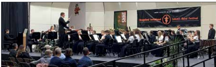
National Honor Band