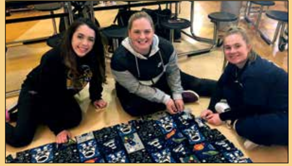
Nearly 100 students donated their time to help make blankets for Student Council's second annual Project Linus event.