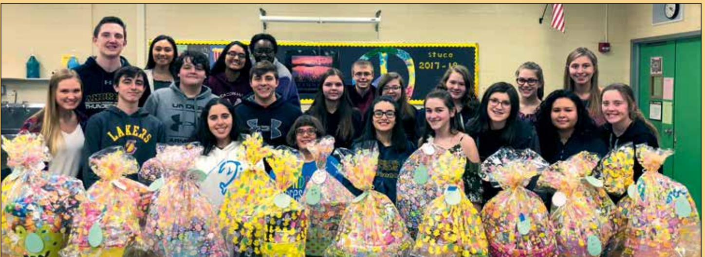
Student Council made, and donated, 20 Easter baskets to Orland Township this spring.