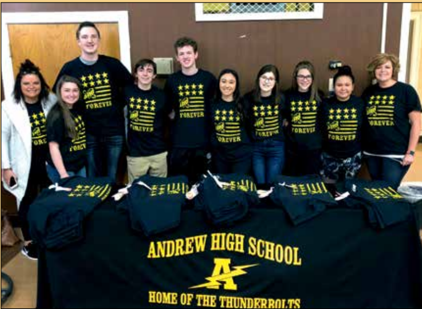
Members of Student Council worked the food pantry at Hines Veterans Hospital.